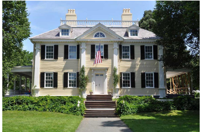
The beautiful home of poet, novelist, and Harvard scholar Henry Wadsworth Longfellow is in Cambridge, Massachusetts.

And by the way, you'll be really surprised to learn which European country's colonial settlers introduced the log cabin to the region along the Lower Delaware River.