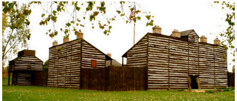
This replica of Fort Wayne (Indiana) is open to visitors. A replica of Fort Meigs sits on a 10-acre site in Perrysburg, Ohio overlooking the Maumee River.

Clearly, this is an important chapter in Ohio's history, so join your compatriots on the 17th to hear this fine presentation.