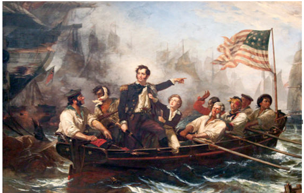
In the giant mural in Ohio's capitol, Commodore Oliver Hazard Perry famously transfers his Command from the Lawrence to the Niagara.

Relax Buckeye fans. OSU plays at Rutgers at 8:00 p.m. so we expect excellent attendance.