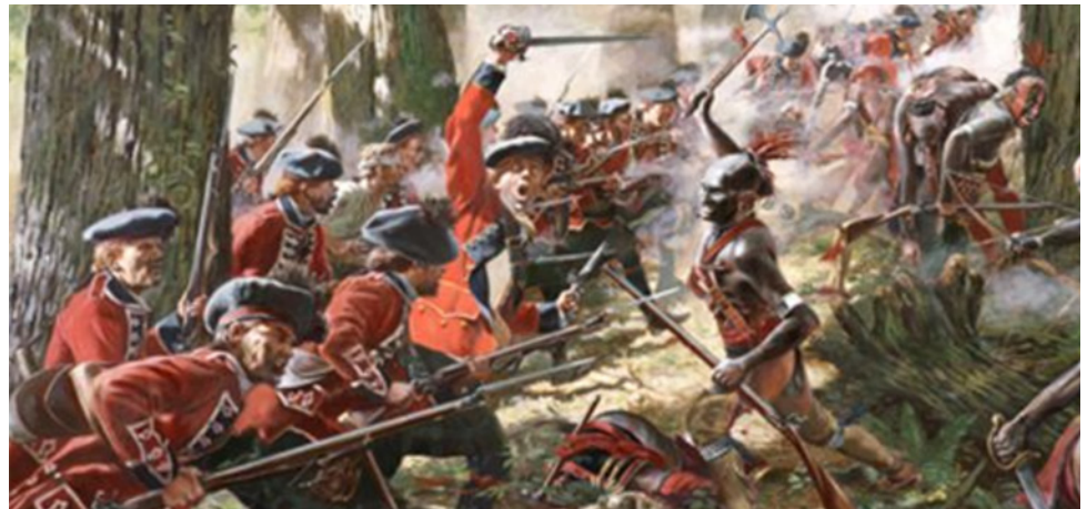
Col. Henry Bouquet ends Pontiac's War in the 1763 Battle of Brushy Run. 1

Pontiac was successful in laying siege to several British forts, until Col. Henry Bouquet became Ohio's savior by defeating Pontiac, ending the War, and requiring the return of whites who had been captured. The exchange was made at what is now Coshocton, Ohio.