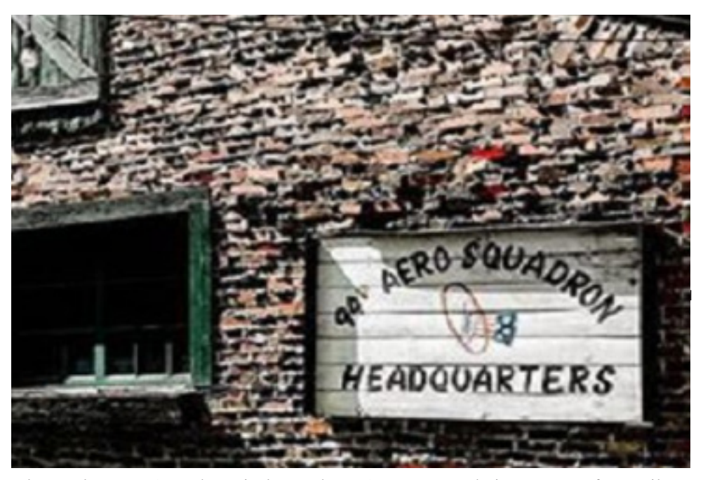
The 94th Aero Squadron is located on Sawyer Road, just west of Hamilton Road.

However, members who have yet to place their reservations can still do so by using the form located on the bottom of the back page.