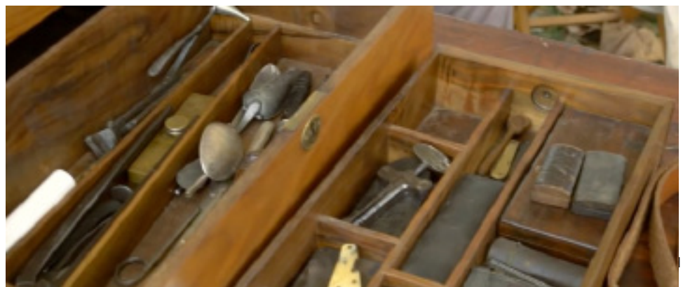
Typical surgical implements during the Revolution included tools for removing musket balls, performing bleeding, and making amputations.

Clearly, this program will both inform and amaze, so it is not to be missed.