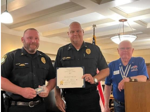
Policeman Awards during Richard Montgomery Chapter meeting – Oct 2nd