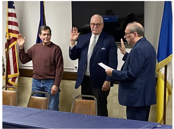
The John Stark Chapter welcomes two new members. December 12, 2024