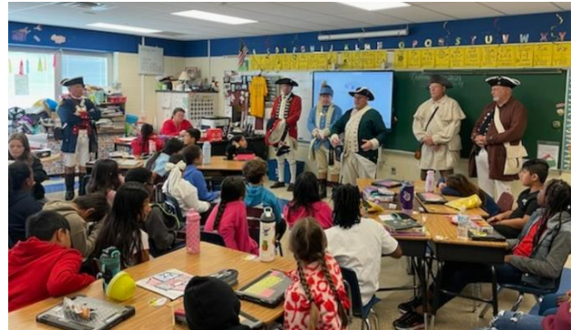
Hocking Valley Chapter presents a school program in Pataskala, Ohio – Nov 9, 2024