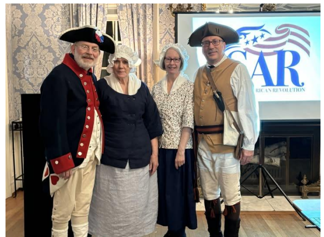
Richard Montgomery Chapter presented a SAR program for the Miami County Historical Society. Nov 21, 2024