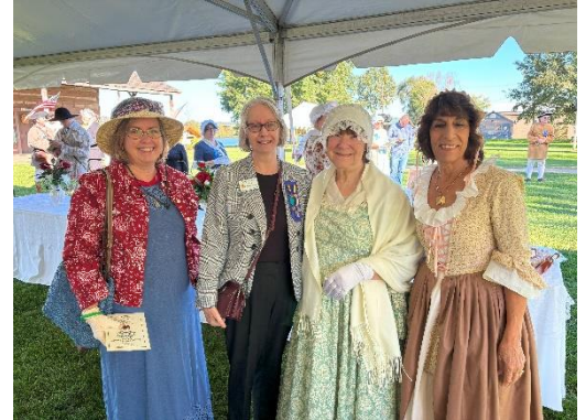
250 th Anniversary of Battle of Point Pleasant