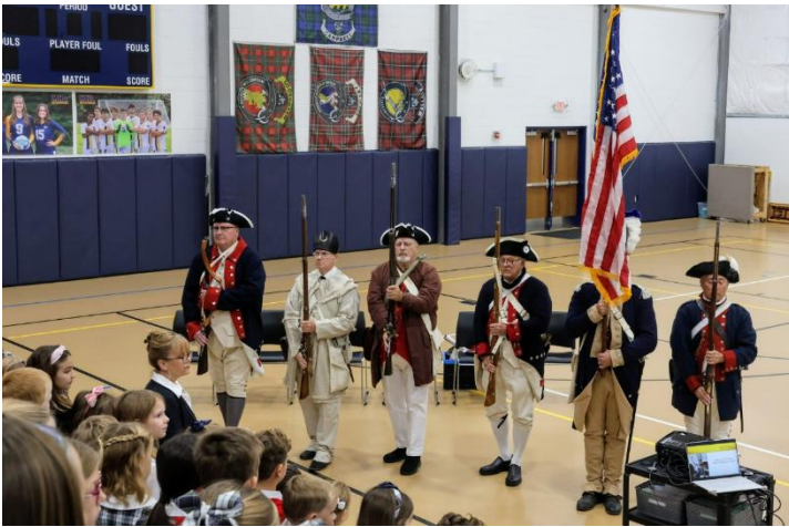
Cincinnati Chapter's Veteran's program at Mars Academy in Mason Ohio – Nov 11, 2024