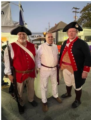
SAR information booth at Circleville Pumpkin Show