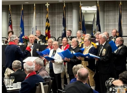
Fall Leadership in Louisville Oct 4-5, 2024