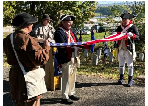
Central District Patriot Grave Marking – Oct 19, 2024