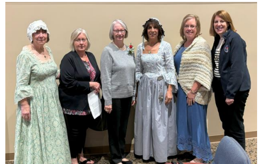
250 th Anniversary of Camp Charlotte Accords