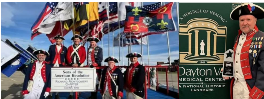
Dayton Veteran's Day parade. Richard Montgomery Chapter wins the "Honor and Glory Award" – Nov 9, 2024