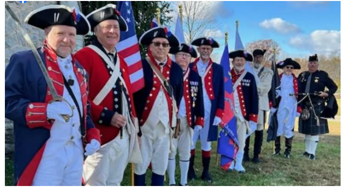
Veteran's Ceremony at Dayton Memorial Park Nov 11, 2024