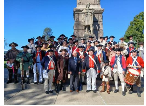
250 th Anniversary of the Point Pleasant Battle – Oct 10, 2024