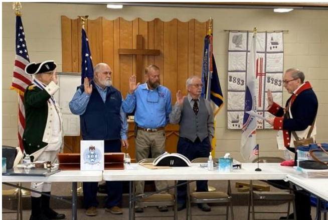
New officers are sworn in at the Rufus Putnam Chapter December 14 th meeting.