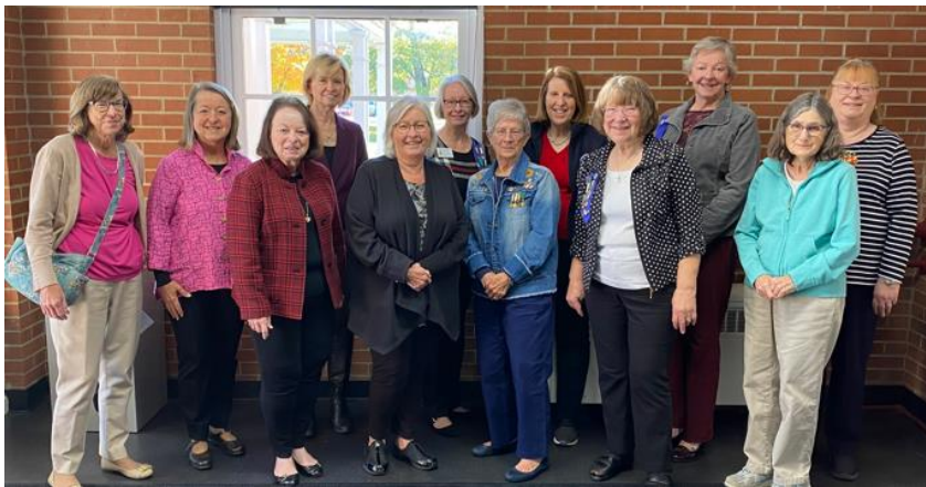
Ladies Auxiliary at Ohio Northern University