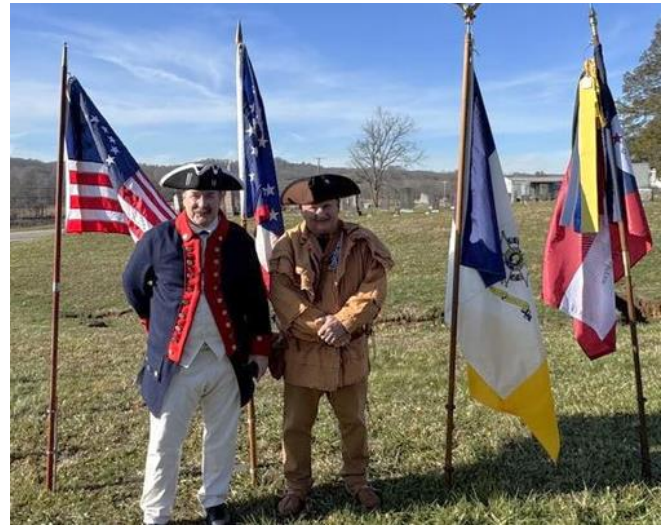
Many chapters participated in Wreaths Across America December 14, 2024

Submit your photos for the next Ohio Country Bulletin to skpk1984@aol.com