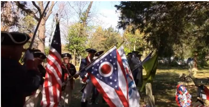
Joint Patriot Grave Marking between Richard Montgomery Chapter and Daniel Cooper DAR Chapter Nov 1, 2024