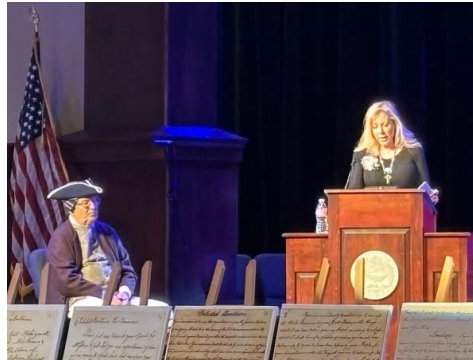
250 th Anniversary of the Camp Charlotte Accords Oct 12, 2024