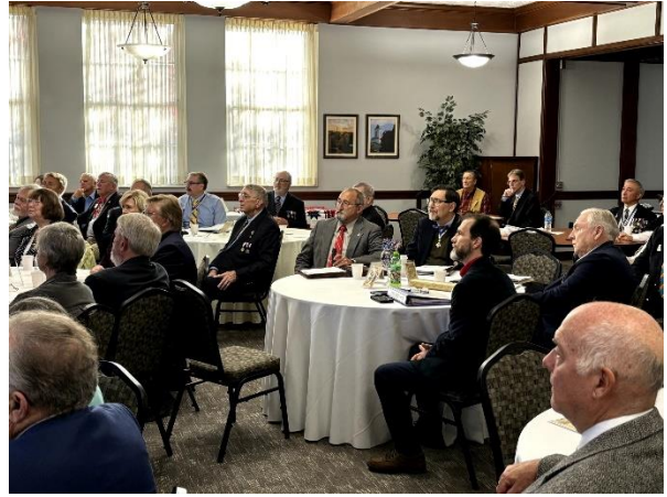
Ohio Northern University Choir performs at the Fall Board of Management Meeting Oct 25-26, 2024