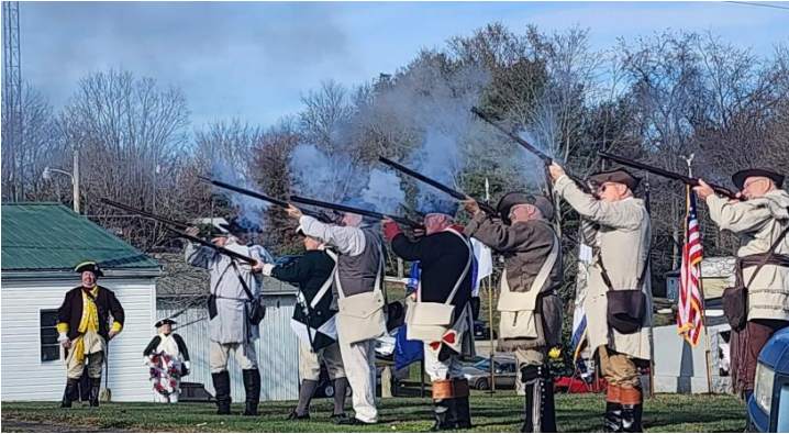
Patriot Grave Marking Nov 9, 2024